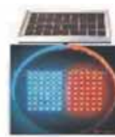
Solar Powered Traffic Alarming Signal SG300-3-FYSM-1A

Volts: 12VDC Watts: 3W Luminous Intensity: >200CD Housing Material: PC Appearance Size: 35cmx35cmx16cm N.W:15KG/PCS