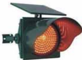
Solar Powered Traffic Yellow Flashing Signal SG300-3-FYSM-1

Volts: 110/220VAC/24VDC Watts: R. 5W, G. 7W Luminous Intensity: >300CD Housing Material: De-Casting Aluminium/PC Appearance Size: 740mmx370mmx160mm N.W: 11.4KGS/PC Packing Manner: 2Units/CTN Packing Dimension: 820mm x380mm x440mm Packing G.W: 25KG